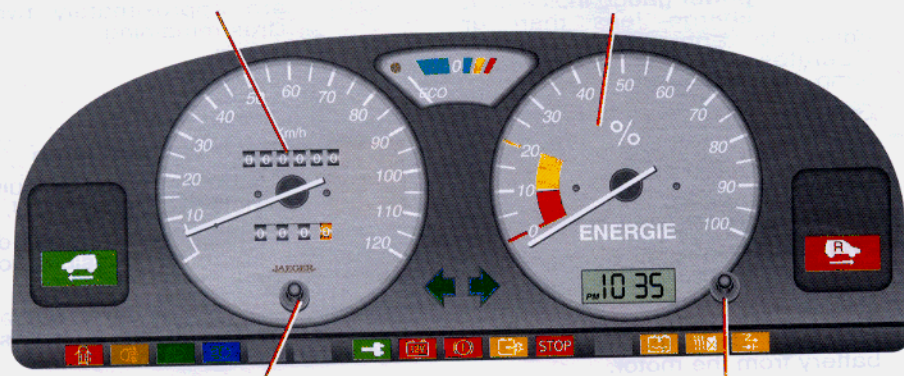
Trip mileage recorder